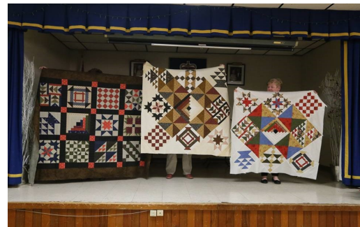
Underground Railway Quilts